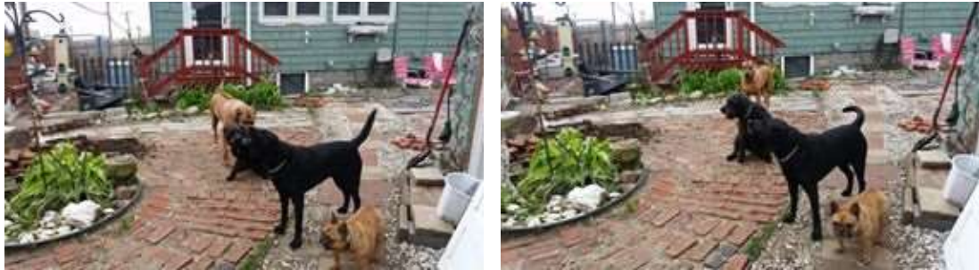
Construction on Rte 6 in Fairhaven has Peppee in an uproar. Rango is back and playing with Rodeo. Bidly likes to administer.