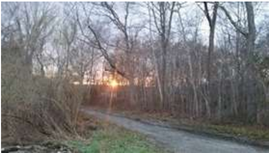
I love when mother nature does my yard work for me. The rain cleaned all the brick, made the new grass grow, and fed my garden. Now, what to do? Taking the dogs down the trail and to the beach off Scoticut Neck in Fairhaven, MA!