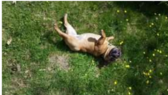
Itchy back. Ahhh I think Bidy likes walks in Acushnet.