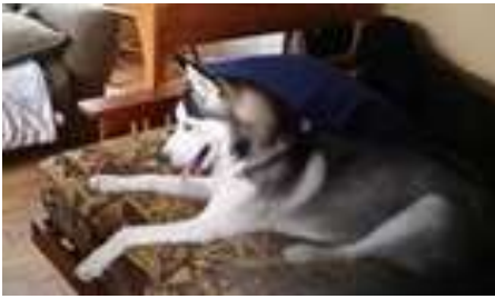
Skye n the “dog room” at Pasa’s Animal Care.