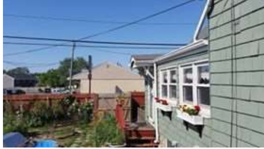
The view from the deck at Pasa's Animal Care in Fairhaven, MA